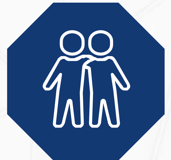
FRIEND OF THE CONFERENCE